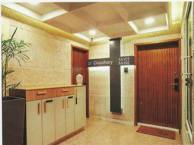
The warm exterior design welcomes the guests into a vivid living room.

The prepossessing and sustainable aesthetic of Resaiki Interiors