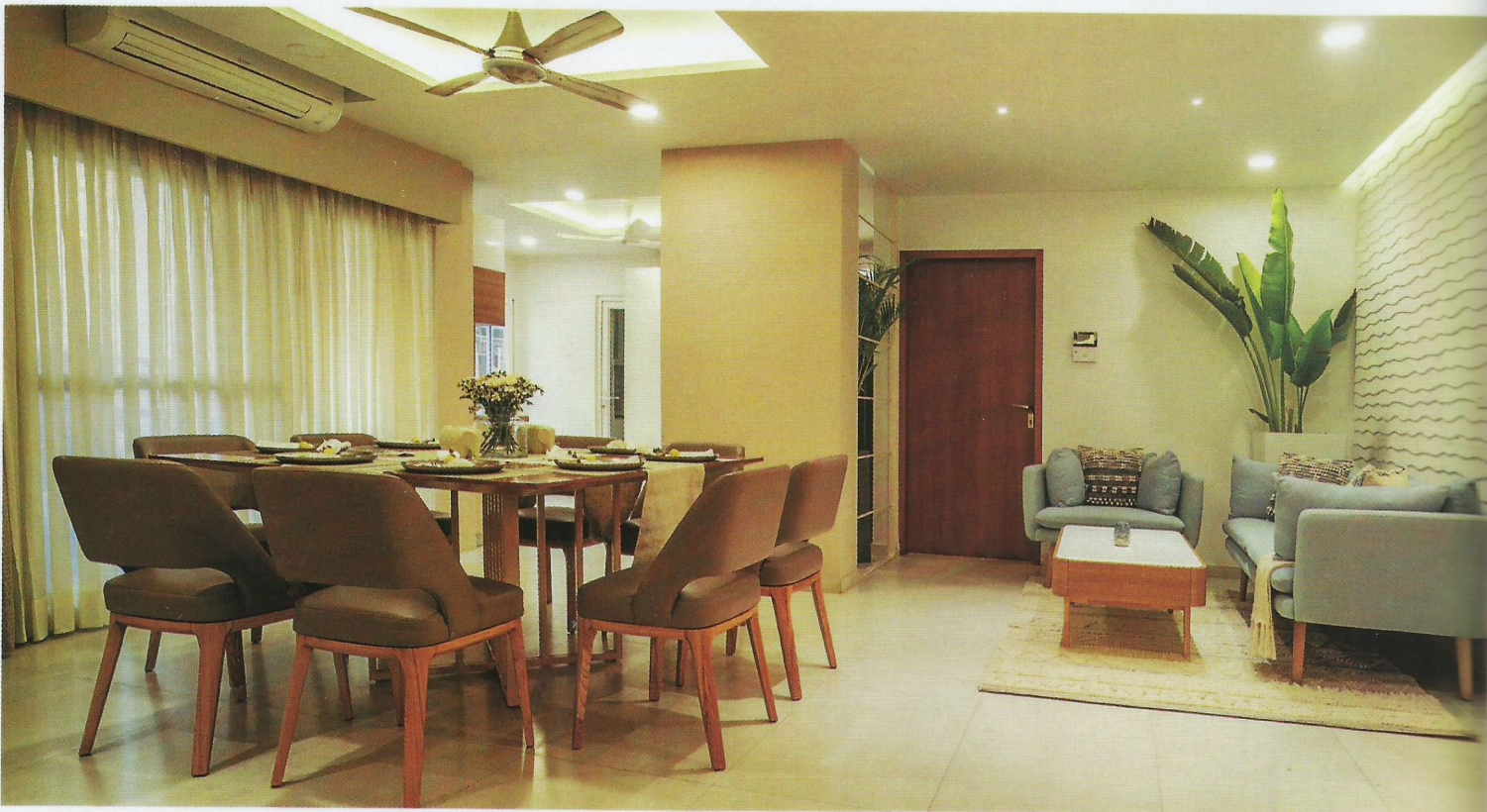
TEXT: DEVINA CHANDOLA