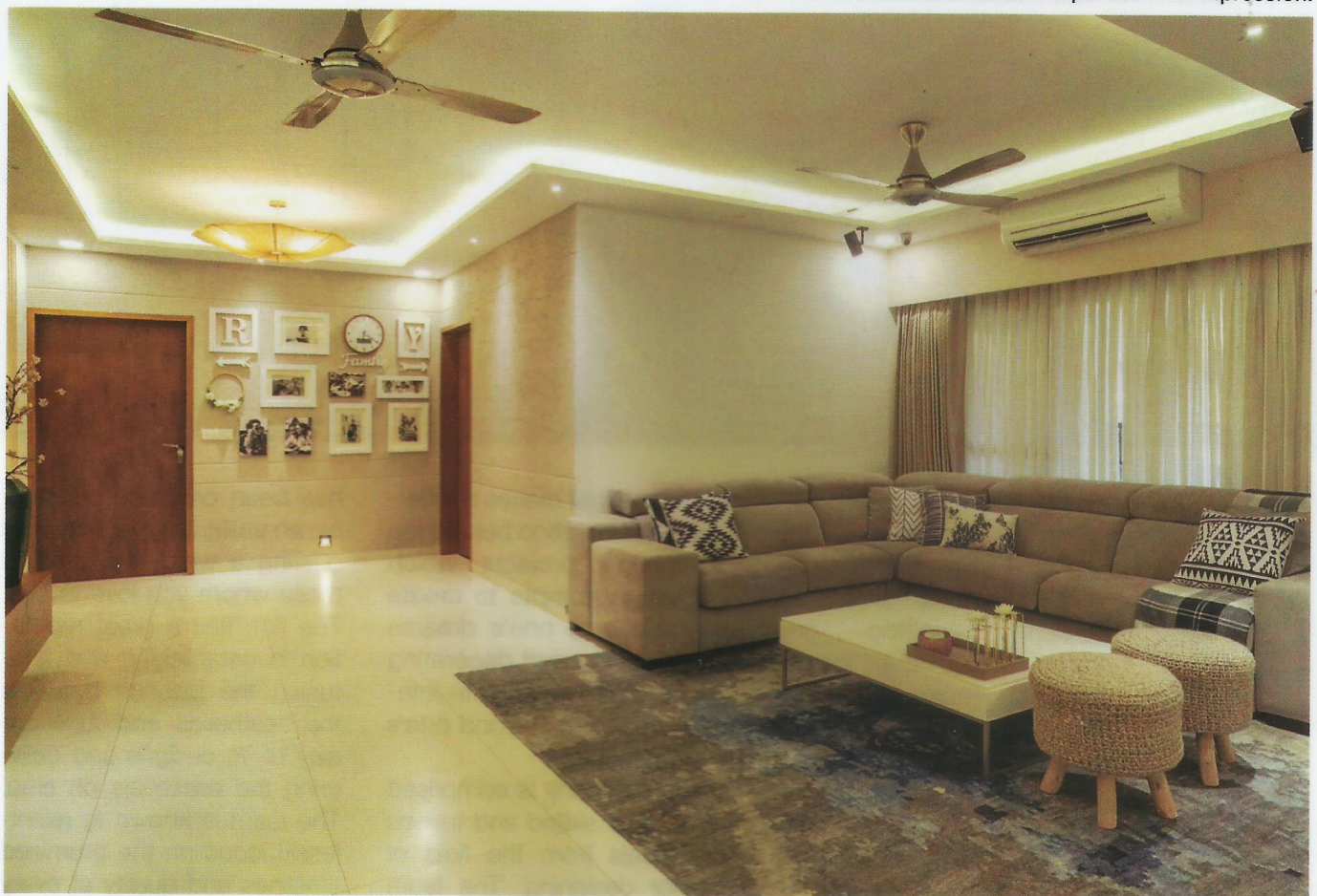
A well-lit ambiance makes the perfect first impression.