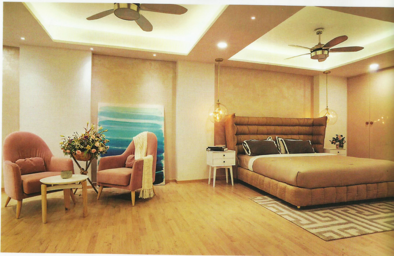
Minimal and breathtaking: space and light work together to create a homely abode.