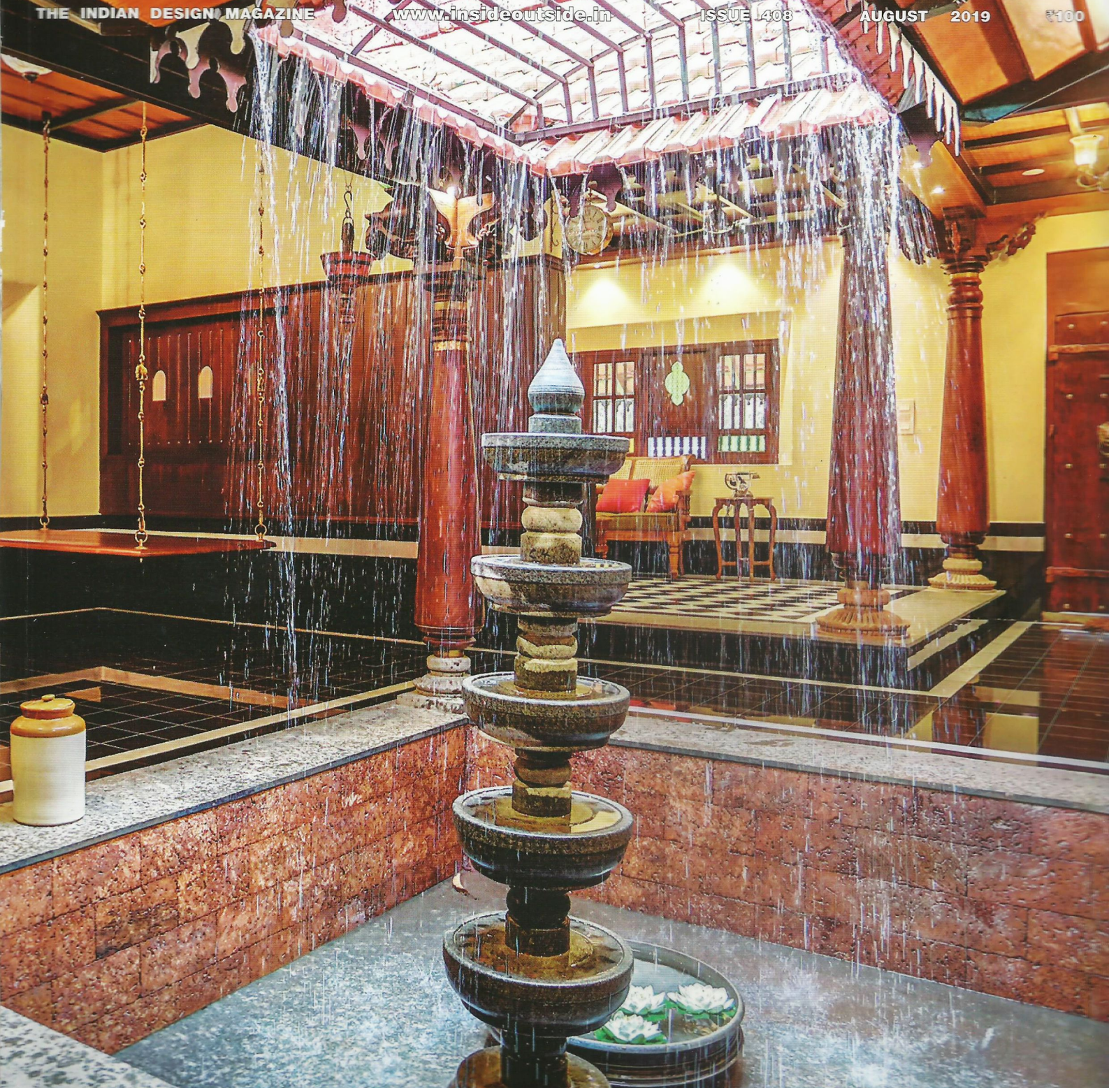
Sreejith Menon designs a nalukettu in Thrissur, Kerala